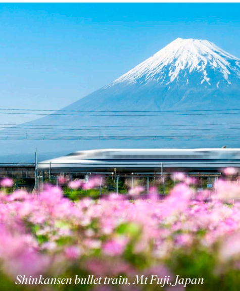
Shinkansen bullet train, Mt Fuji, Japan