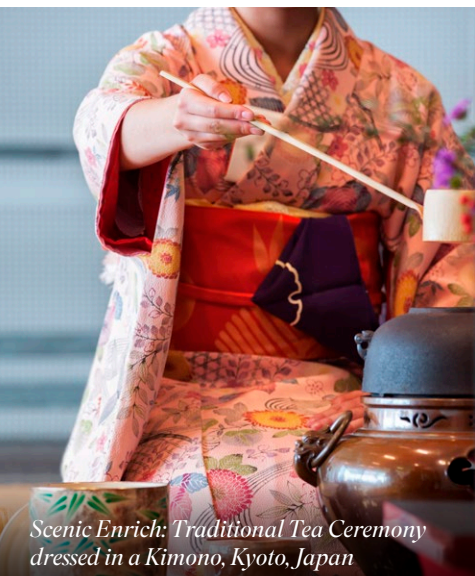
Scenic Enrich: Traditional Tea Ceremony dressed in a Kimono, Kyoto, Japan