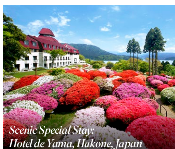
Scenic Special Stay: Hotel de Yama, Hakone, Japan