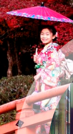
Hotel Indigo Inuyama Urakuen Garden, an IHG Hotel, Japan

Uncover the wonders of Japan, where ancient history and natural beauty converge. From poignant World War memorials to spiritual temples and pagodas, each step unveils a new layer of history, splendour, and warm local hospitality.