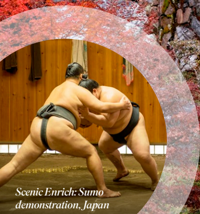
Scenic Enrich: Sumo demonstration, Japan