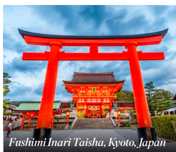
Fushimi Inari Taisha, Kyoto, Japan